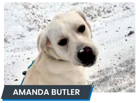
"Winter walks with our dog, Boone."