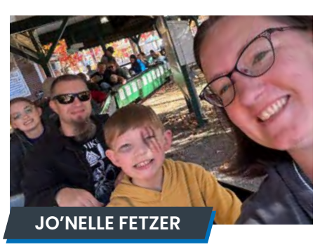
"Our annual family trip to Knoebels for Hallo-Fun Nights in October!"