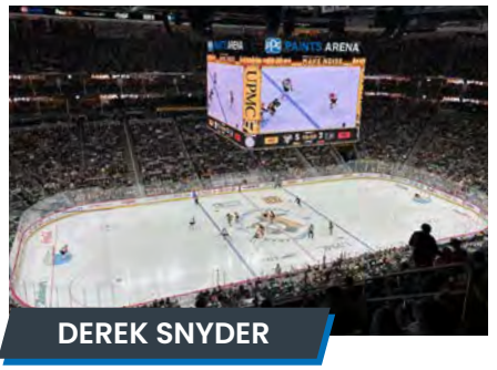
"Watching the Penguins beat the Flyers!"