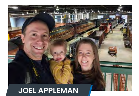
"A long weekend family trip to the Lancaster area where we visited local attractions including the Railroad Museum of Pennsylvania in Strasburg."