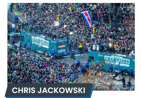
"As a Philly resident, there's a special energy that takes over the city when one of our teams enters the postseason. The sense of community really comes alive. The Eagles Super Bowl victory was the perfect excuse for a city-wide celebration of a well-deserved win."