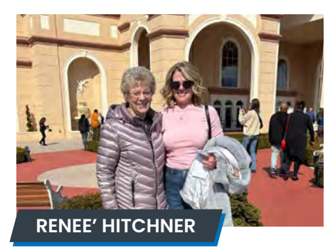
"Experiencing Noah at Sight and Sound Theatres in Lancaster with my mom. Sight and Sound never disappoints—it's always a fabulous show."